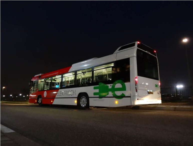
Caption: IPT permits a 12-metre electric bus three times the length of service (Conductix-Wampfler)