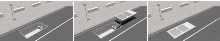
Caption: Once the hole has been prepared, the concrete shaft is installed at the stop, the charging module is connected up to the power grid and after installation only the charging plate is visible and the road is barrier-free