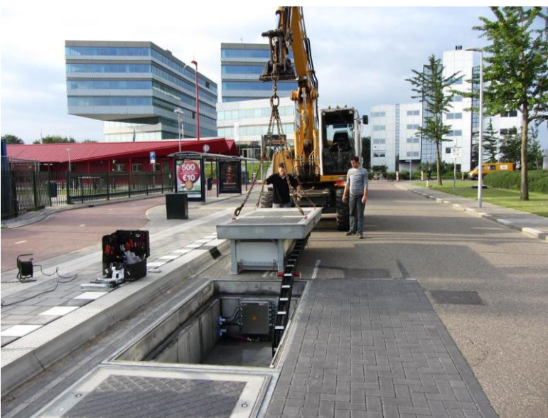
Caption: Installing a 60 kW charging module at a bus station with 120 kW charging capacity (Conductix-Wampfler)