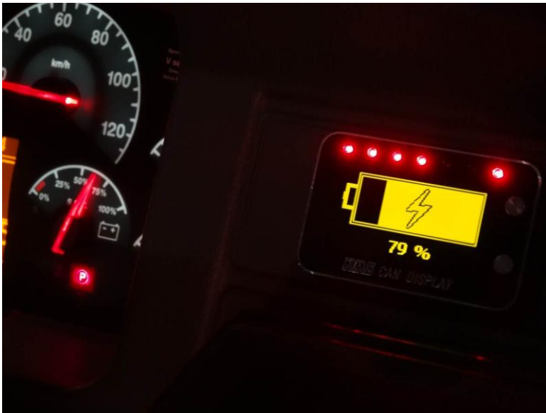
Caption: Convenient and safe charging from the driver's seat (Conductix-Wampfler)